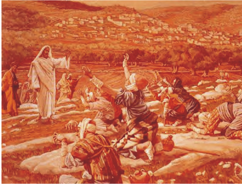
Jesus Heals the Ten Lepers